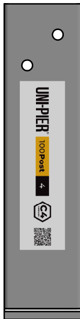
200x100x10 M.S. Plate with 2xØ18mm Holes