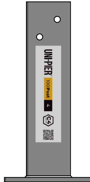
200x200x10 M.S. Plate with 4xØ18mm Holes